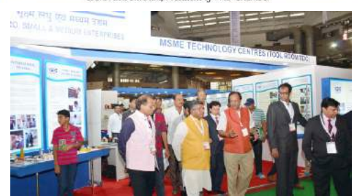
Shri Ravi Shankar Prashad, Union Electronic & IT Minister