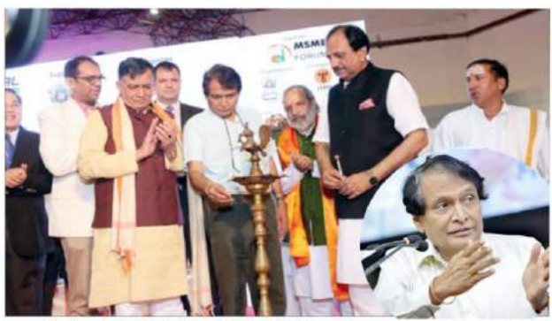
Sh. Suresh Prabhu, Union Minister of Railways, Commerce & Industry with Sh. Satish Mahana, Industry Minister, UP & Sh. Jai Bhagwan Goel Inaugurating 5th Expo