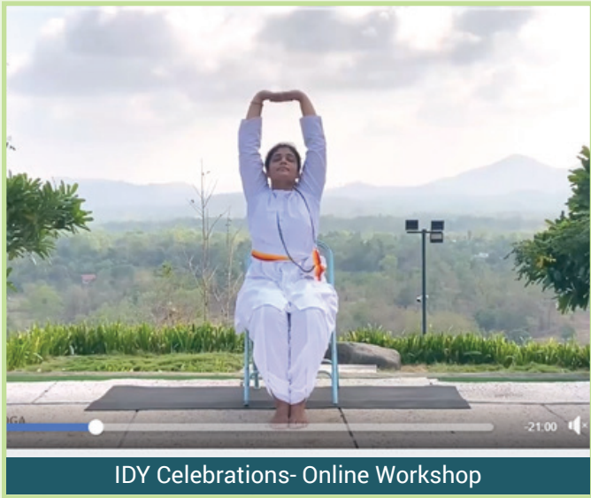
IDY Celebrations- Online Workshop