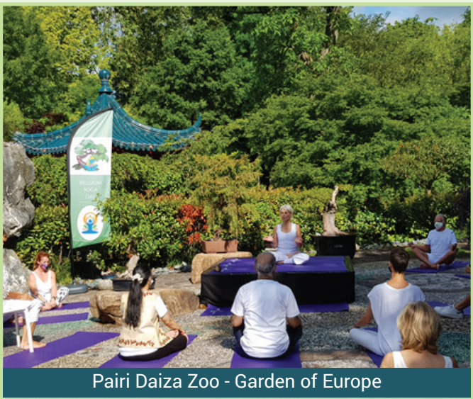
Pairi Daiza Zoo - Garden of Europe