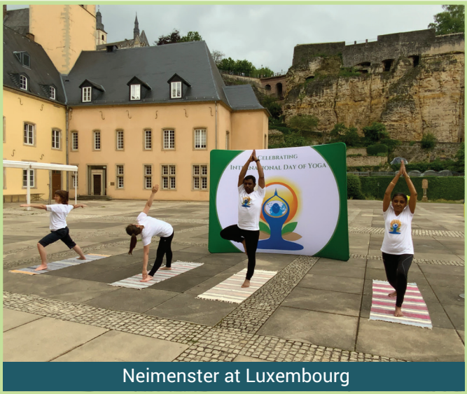
Neimenster at Luxembourg