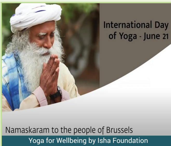
Namaskaram to the people of Brussels Yoga for Wellbeing by Isha Foundation