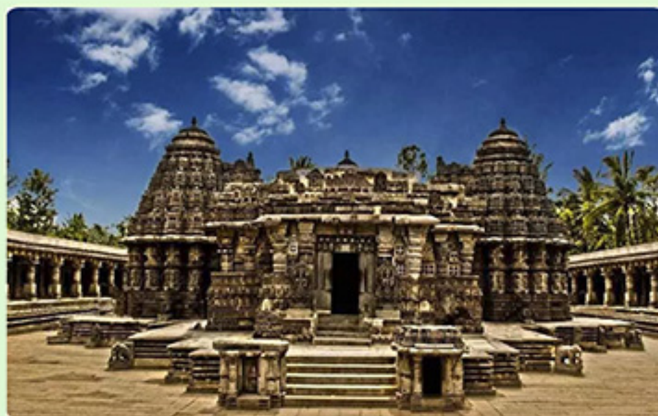
Hoysala Temple, Somanathpura

Having seen the rise and fall of several dynasties, major and minor, the state of Karnataka is dotted with monuments, rich in architecture and history. In September 2023, a group of monuments dating to the 9 th - 10 th Century C.E, constructed by the Hoysala dynasty, was inscribed as a UNESCO World Heritage Site, making it the third such group from Karnataka. (The other two being the group of monuments in Hampi and Pattadakal.)