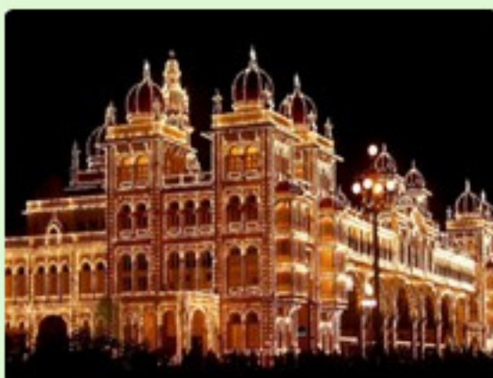
The Royal Mysore Palace

The city of Mysuru decks itself up in lights during the Dasara celebrations, to welcome thousands of national and international tourists. The Royal Palace of Mysore under lights is a sight to behold! Food festivals are organized, catering to a wide variety of cuisines. Cultural performances, including specific platforms for the young artists are patronized by the royal family as well as the Government of Karnataka.