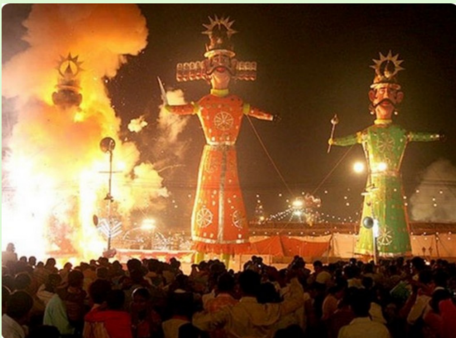
The Ram Lila