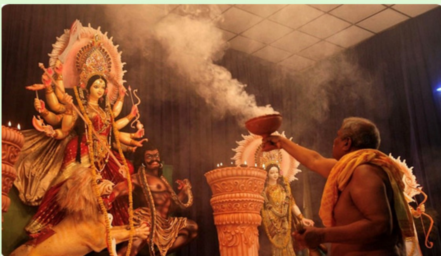
The Durga Puja

A prominent city to soak in the splendour and grandeur of the Dasara celebrations is Mysuru/Mysore in the state of Karnataka. Karnataka is a successor state to the erstwhile princely state of Mysuru, and observes the Dasara as a State Festival, maintaining a link with a long and illustrious history of the state. The kingdom of Mysuru itself was a successor to the glories of the powerful Vijayanagar Empire. In Mysuru, the kings have been celebrating the Dasara since 1610 AD.