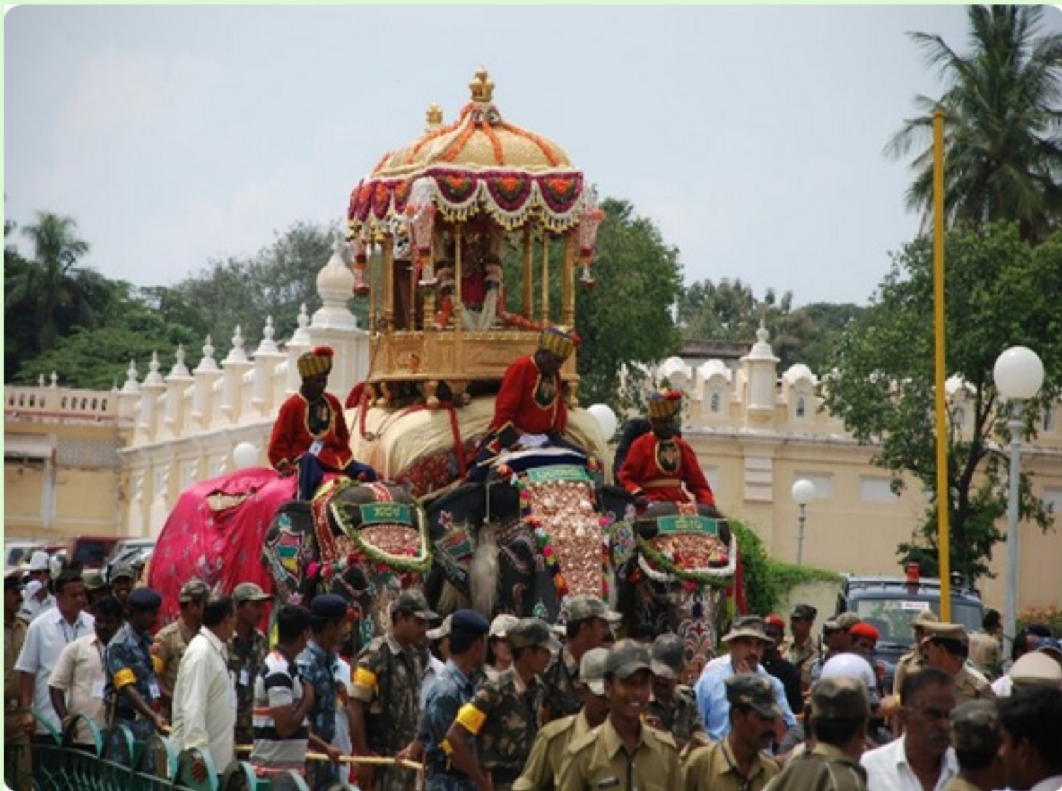
The Jamboo Savari/Elephant Procession

One of the major attractions of the Dasara celebrations in Mysuru is the procession of the elephants, with the leader of the herd carrying the golden howdah. Until a few years after independence, the king/scion of the Wodeyar dynasty would sit in the howdah as the elephants marched through the city, accepting the respects of the citizens. Once the State of Karnataka took over the celebrations of the Dasara, the idol of Goddess Chamundeshwari is kept in the howdah and carried in procession. Today, along with the elephant procession, tableaux depicting various monuments, government policies, successful projects in the different districts of Karnataka are also shown, not to mention the colourful cultural troupes accompanying them.