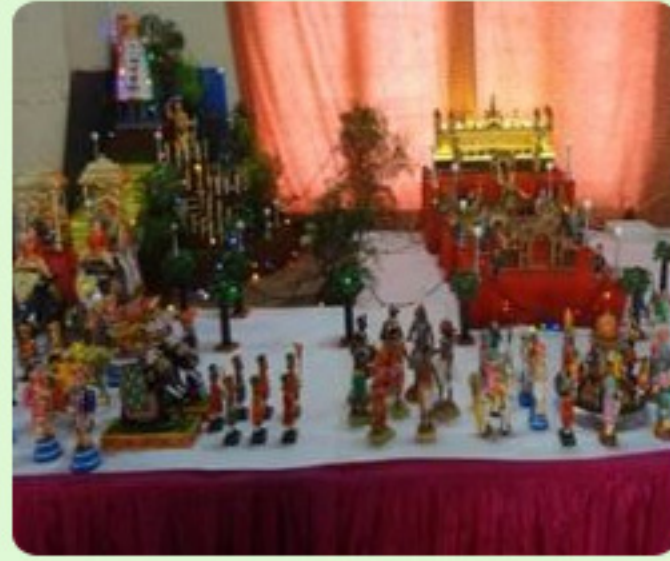
The Dasara Doll Festival

Indeed, the Dasara festival season is a good time to visit Karnataka. However, the vast and rich state offers a diverse set of experiences, living up to its tagline of “One State, Many Worlds.”